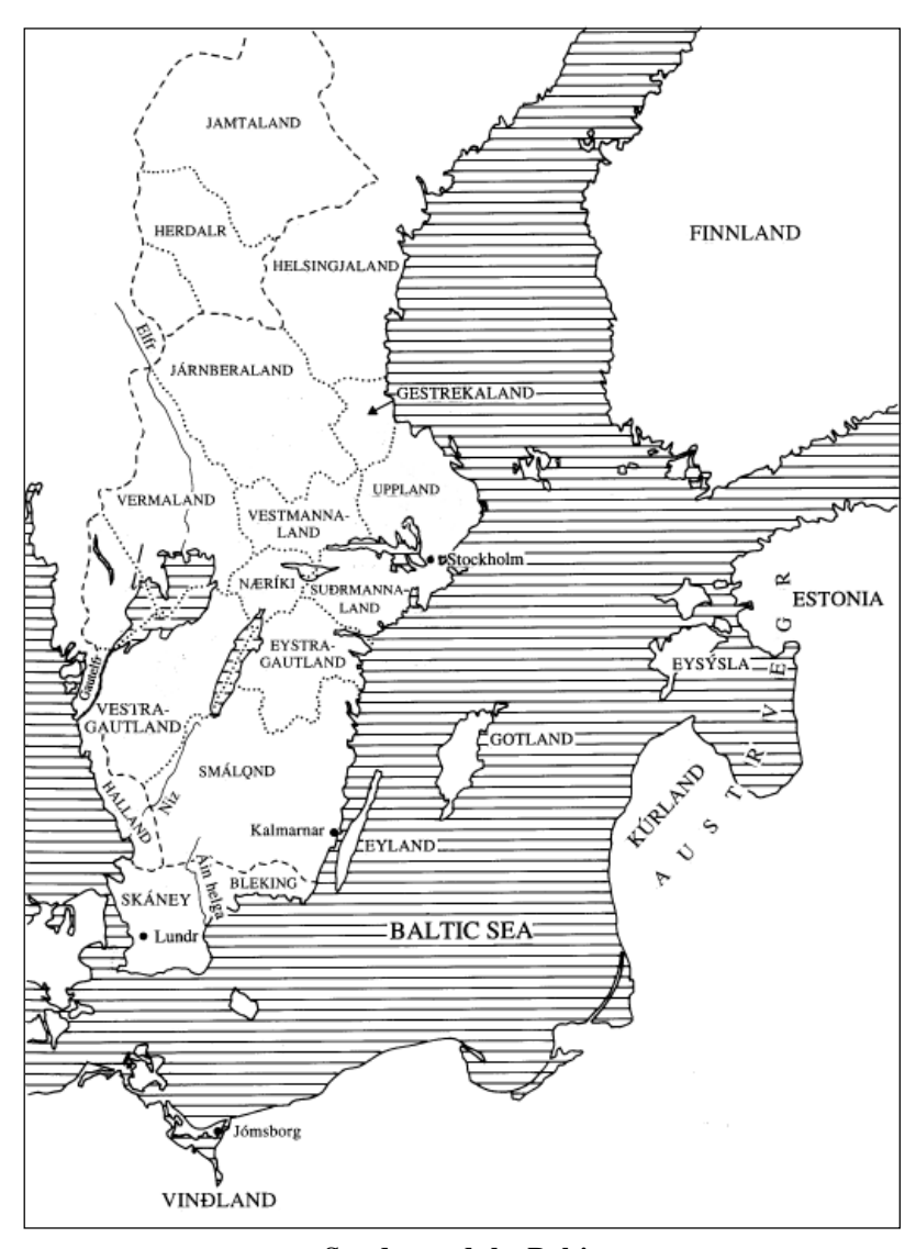
Sweden and the Baltic